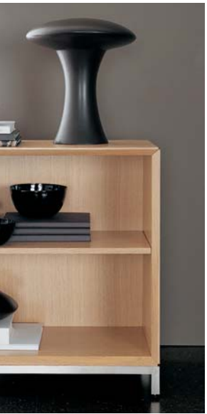
CABINETS EXHIBIT FINELY CRAFTED detailing AT ALL INTERSECTING PANELS AND EDGES.