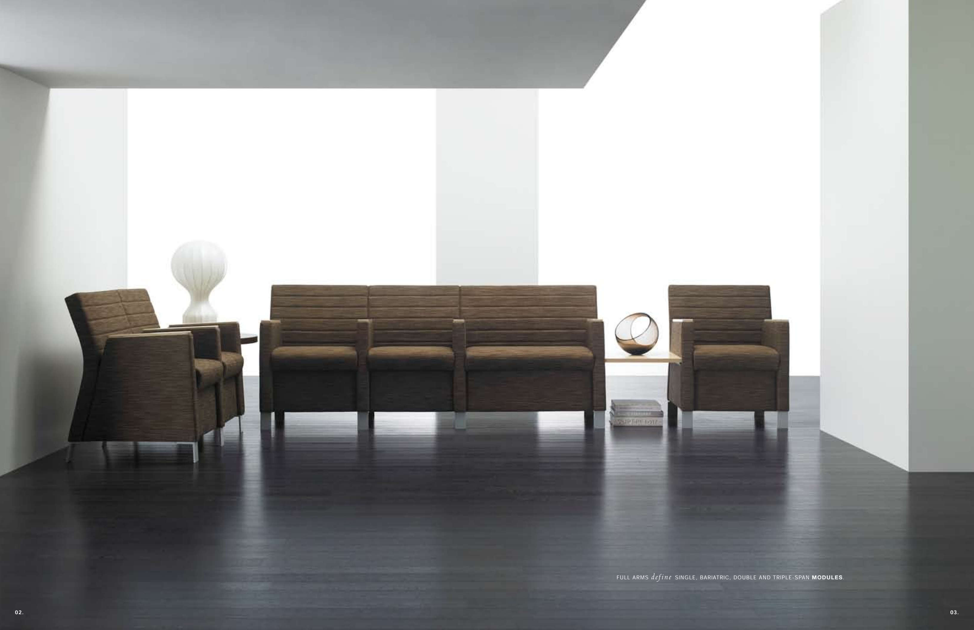
FULL ARMS define SINGLE, BARIATRIC, DOUBLE AND TRIPLE-SPAN MODULES.