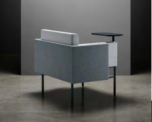
Leit System. A robust system of freestanding and integrated seating, tables, and panels.