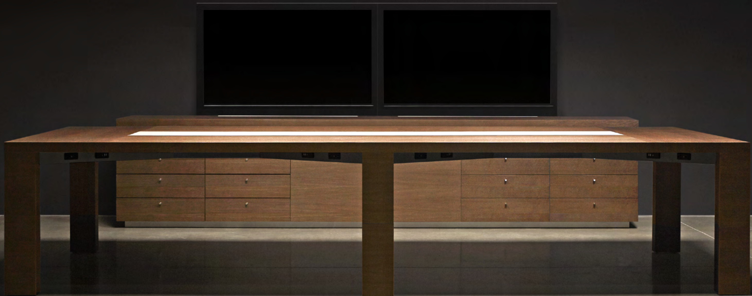
Massif Table. Bold and balanced. Shown with a Karo Collection credenza.