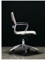
902 Manager, Loop Arms