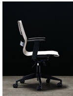
902 Manager, Adjustable Arms