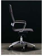
902 High Back, Loop Arms