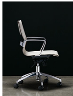
902 Manager, Loop Arms Standard Option