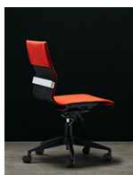
902 Manager, No Arms Standard Option